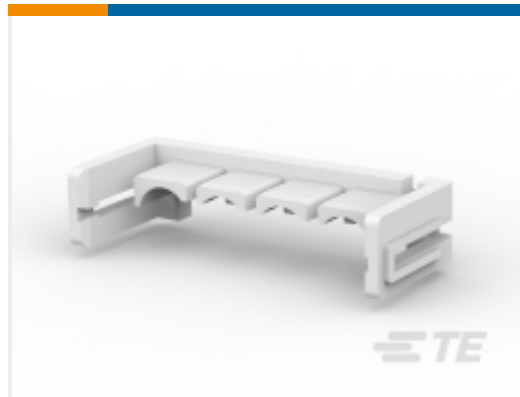
TE Part # 177920-1 POWER DBL LOCK PLATE 3.96MM 4POS