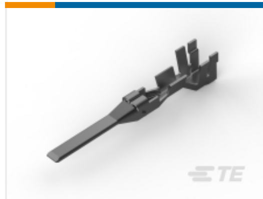
TE Part # CAT-P87024-T111 Power Double Lock Tab